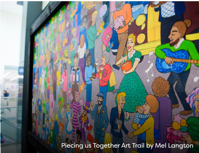
Piecing us Together Art Trail by Mel Langton