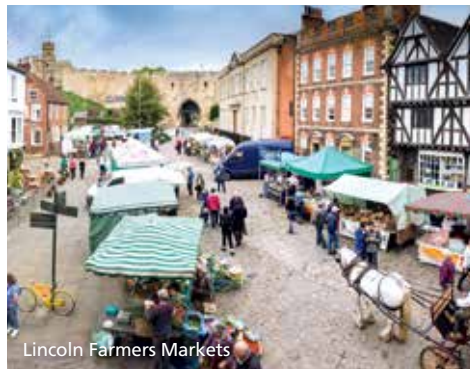
Lincoln Farmers Markets