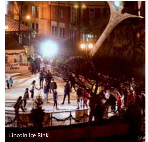
Lincoln Ice Rink

For more information email events@lincolnbig.co.uk or visit our website www.lincolnbig.co.uk