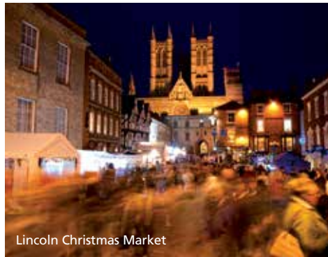
Lincoln Christmas Market

We coordinate a range of markets including regular Farmers Markets in City Square, High Street/Cornhill and Castle Hill every month; Craft Markets from March to December, Artists Markets from May to September and also Antique, Continental and Italian markets.